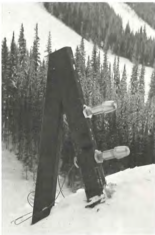
Figure 1.--Steel frame with two load cells.

Numerous difficulties and failures of equipment had to be overcome during the first 3 years before reliable observations were obtained. Between 1970 and 1972, however, impact pressures produced by several dry snow avalanches were recorded.